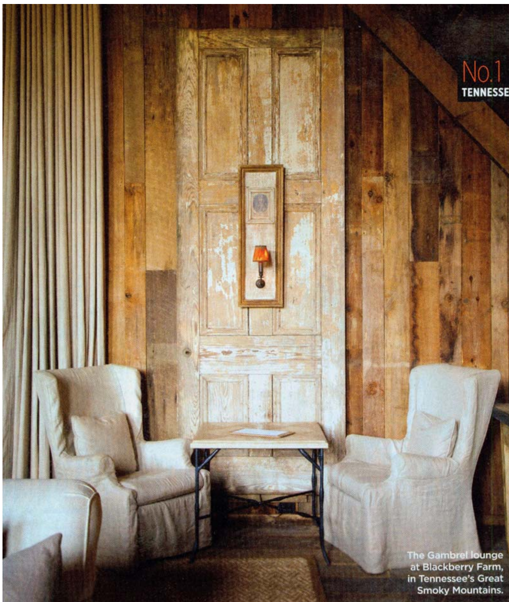
The Gambrel lounge at Blackberry Farm, in Tennessee's Great Smoky Mountains.

NEW Trump SoHo (89.33) 46-story tower suited for stylish SoHo thanks to touches by Trump's daughter Ivanka: muted interiors and a traditional hammam. 246 Spring St.; 855/878-6700; trumpotelcollection.com; doubles from $449-$895.