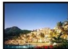
Vacationist Hotel Deals: Memorial Day in Mexico