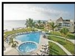
3 Fabulous Family Getaways