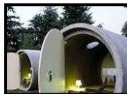
Most Unusual Hotels in the World