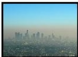
America's Dirtiest Cities